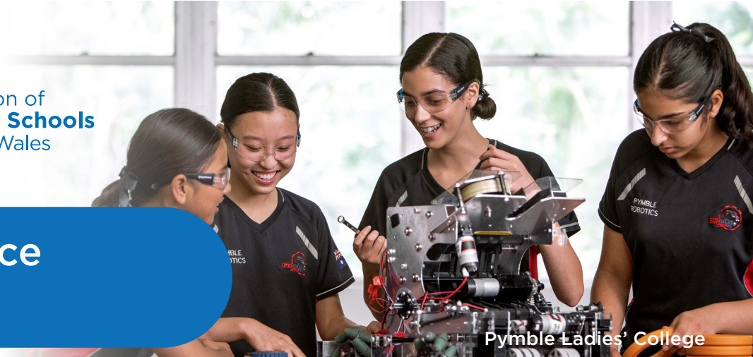
Pymble Ladies' College

The Association of Independent Schools of New South Wales