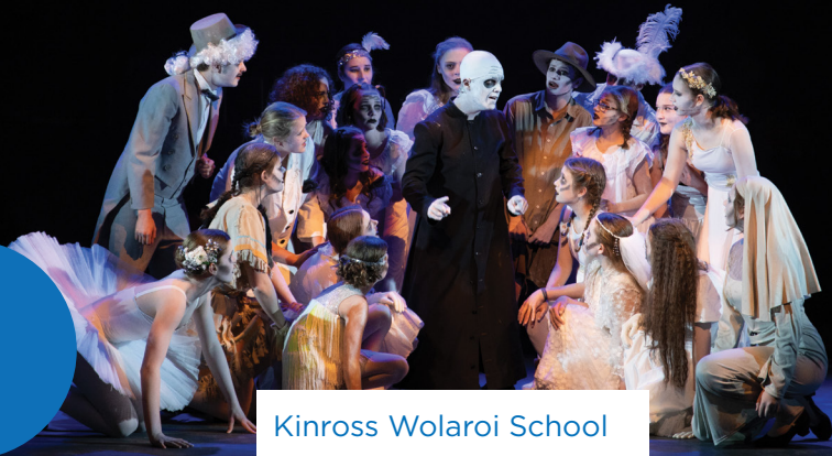
Kinross Wolaroi School

The Association of Independent Schools of New South Wales