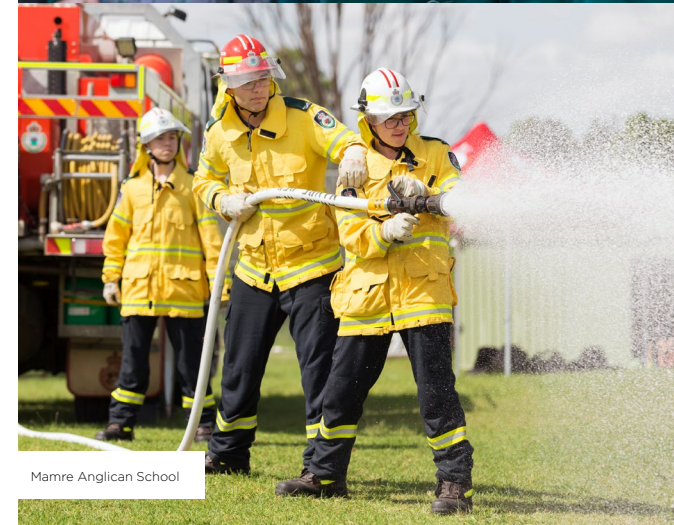
Mamre Anglican School