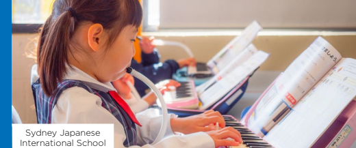
Sydney Japanese International School