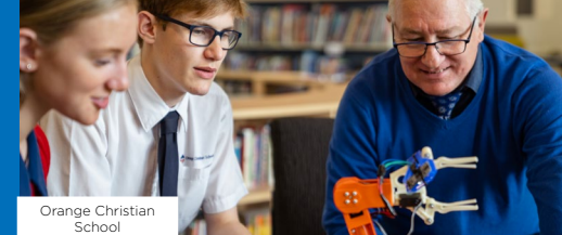
Orange Christian School