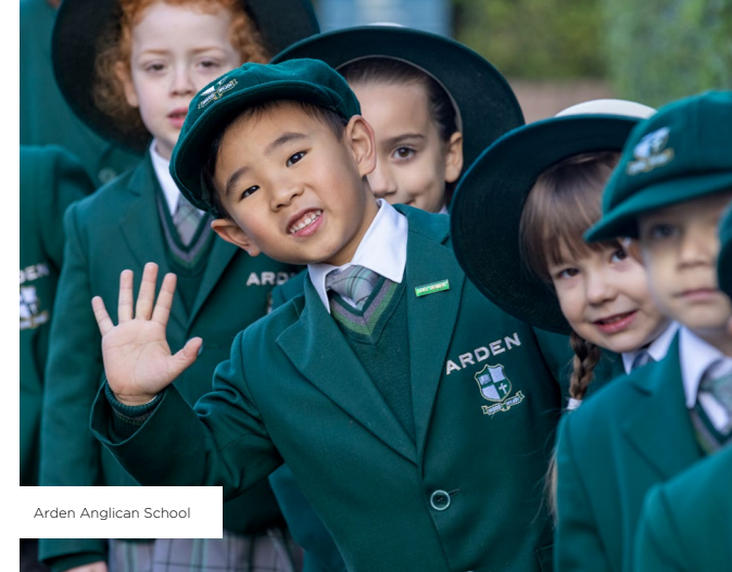
Arden Anglican School