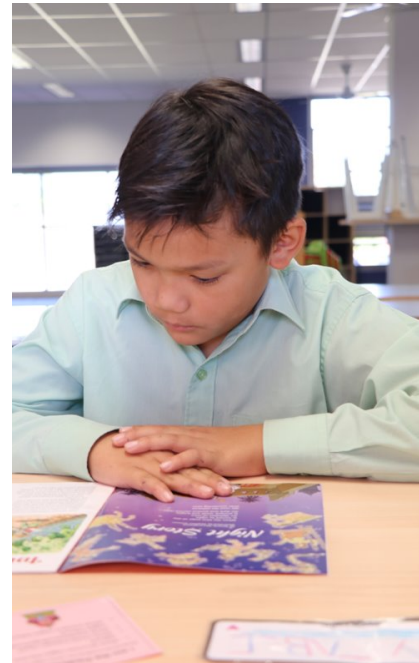
Oral or silent reading of a text