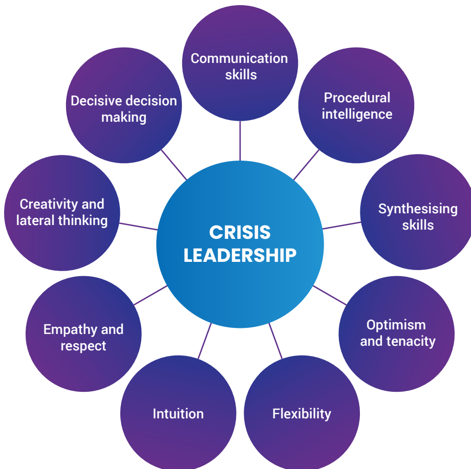
Figure 1. Key attributes for crisis leadership (adapted from Smith & Riley, 2012, p.68).

There is a myriad of literature on crisis leadership theory, however, less common is literature discussing operational expectations during response and recovery stages. School leadership in times of crisis requires a distinctive set of competencies and skills (Mutch, 2015; Smith & Riley, 2012). As shown in Figure 1, this includes decisive decision-making, intuition and flexibility, creativity and lateral thinking, tenacity and optimism, procedural, intuitive, and creative intelligence, different ways of thinking, and communication and media skills (Smith & Riley, 2012, p.65).