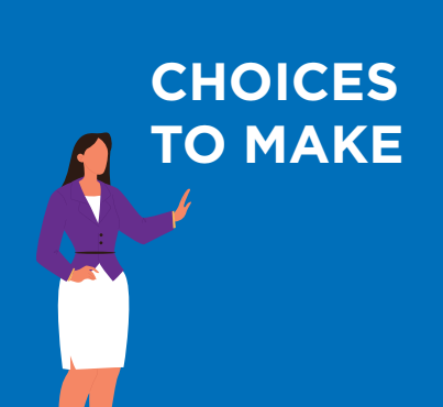
What kind of teacher do you want to be?